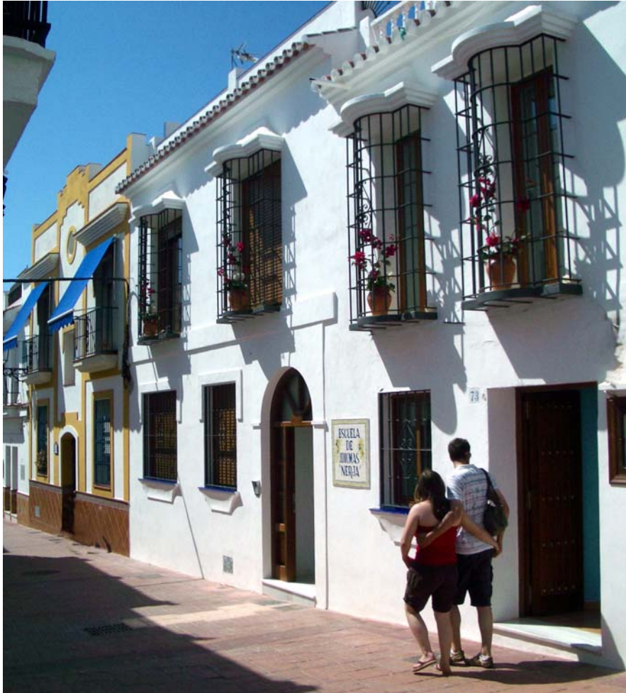
Escuela de Idiomas Nerja