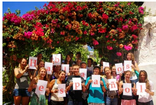
Spanish class in the garden